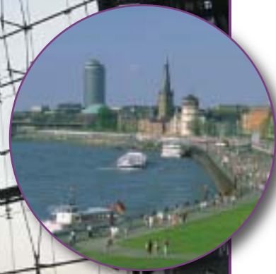
Düsseldorf offers you an ideal environment for concentrating on academic success.