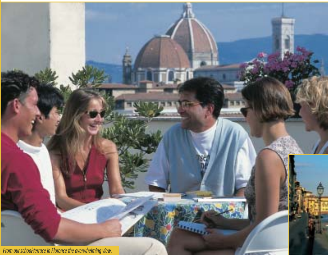
From our school terrace in Florence the overwhelming view.